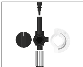
Professional fine foam frother