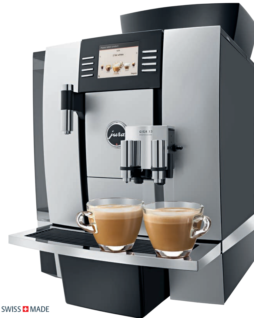
15002 JURA GIGA X3 Tank Version