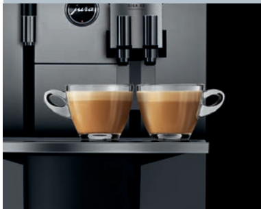
2 milky coffees in one shot