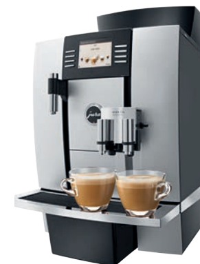
15003 JURA GIGA X3c with Fix Water Connection

With a wide selection of accessories including a cup warmer, milk cooler, coffee grounds disposal function set, drip drain set and interface for accounting systems, as well as an attractive range of storage and presentation units, it is possible to create a complete coffee solution tailored to your specific requirements.