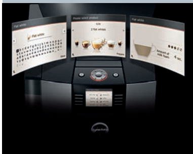
Individually programmable start screen