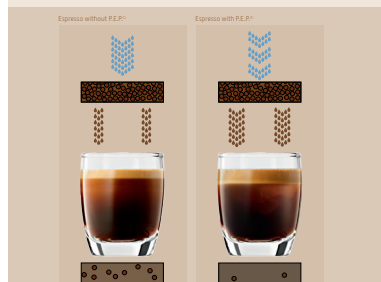
P.E.P.® Brewing System