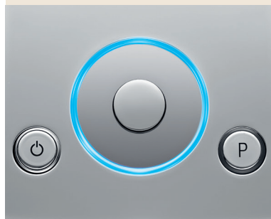
Rotary Switch with its Blue Crystal

* The separately available Smart Connect Bluetooth® transmitter / receiver is necessary for this.