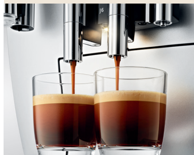
Espresso in Barista quality